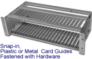
Snap-in, Plastic or Metal Card Guides Fastened with Hardware